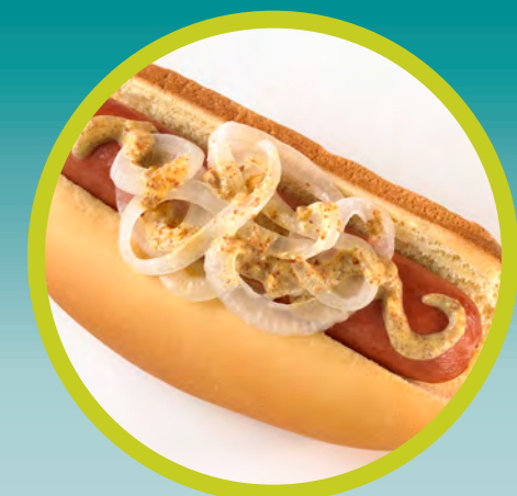
NEW YORK DOG